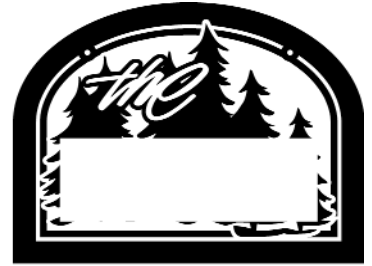
$175 - 10" X 13"