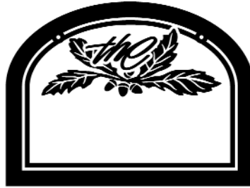
$175 - 10" X 13"