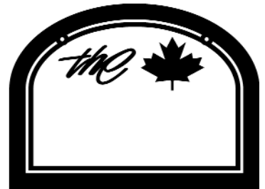
$175 - 10" X 13"

5 MOUNTING METHOD (Click one): Flat or Hanging