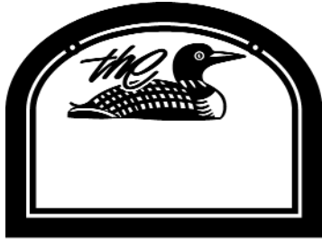
$175 - 10" X 13"

Yes, I require a proof ? Fax No. ( ) _____ Attn: _____